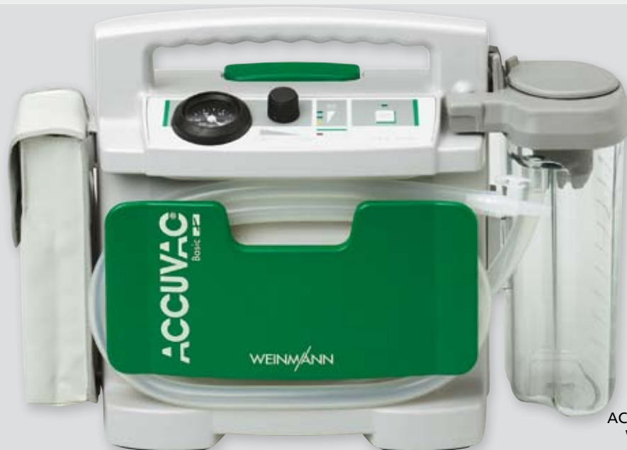
ACCUVAC Basic, WM 10709

Secretions in the patient's respiratory tract hinder ventilation and gas exchange and thus reduce the effectiveness of ventilation. Only after the secretions have been removed can effective ventilation take place. With the secretion suction pump ACCUVAC Basic the suctioning of the oropharynx is simple and safe. Thanks to the infinitely adjustable vacuum regulation, the pump can be used in any situation – even in pediatrics.