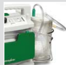
Disposable collection canister