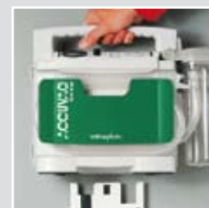
Wall mounting incl. installation set