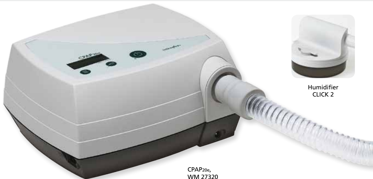
CPAP20e, WM 27320

Weinmann's best-priced CPAP20e guarantees effective CPAP therapy – and thus healthy sleep. User-friendliness and economy are the watchwords for the simple and efficient operating functions.