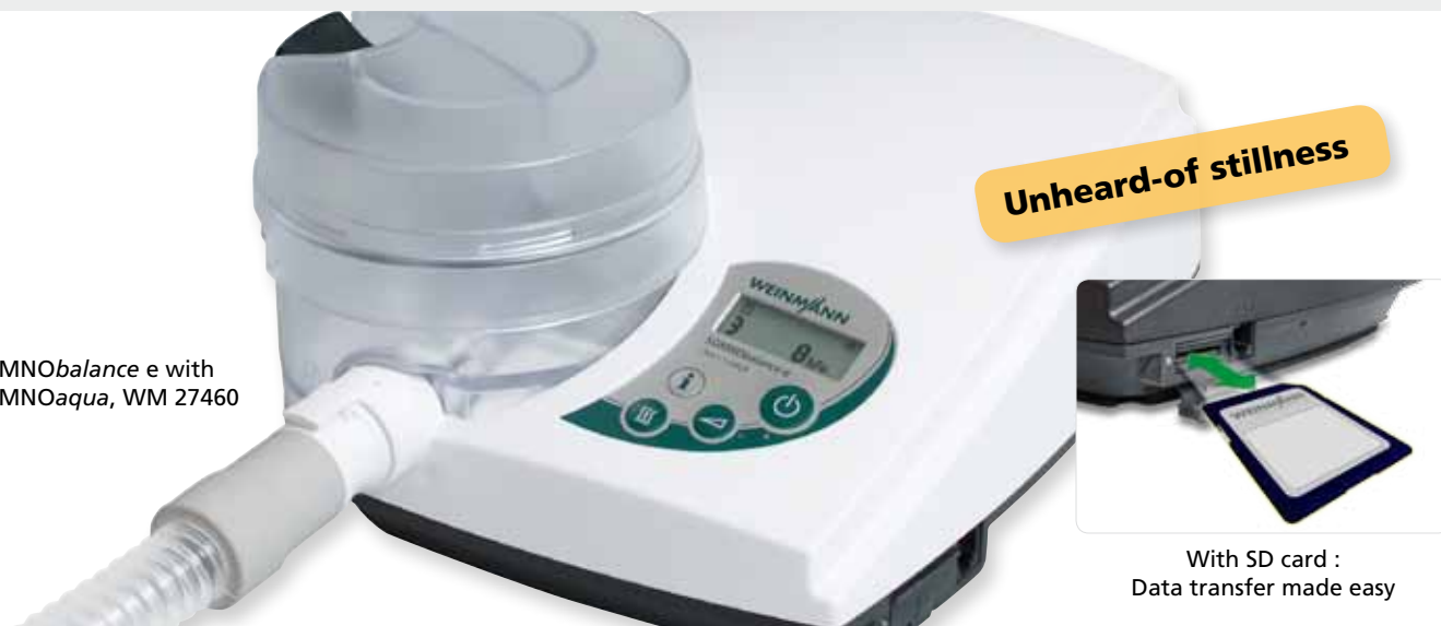
SOMNObalance e with SOMNOaqua, WM 27460

The autoCPAP therapy device SOMNObalance e is equipped with Obstructive Pressure Peak (OPP) technology which reliably distinguishes obstructive from central events. With automatic and continuous pressure adjustments in response to patient needs, the device offers great flexibility in therapy options. A selection of modes, which can be combined with intelligent softPAP pressure relief, makes SOMNObalance e even more flexible. The SD card helps to significantly optimize work processes.